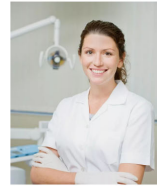
→ TEAM MEMBER TWO Team Member Title