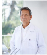
→ TEAM MEMBER ONE Team Member Title

Morbi blandit cursus risus at ultrices mi tempus imperdiet. Elit eget gravida cum sociis natoque penatibus et magnis. Aenean vel elit scelerisque mauris pellentesque pulvinar.