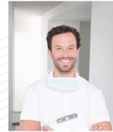
→ TEAM MEMBER THREE Team Member Title

Provide office information identical to this (May include fax number).